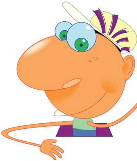
Figure This! Why are most manhole covers round?

Hint: Investigate different shaped covers to see if they can fall through their corresponding holes.